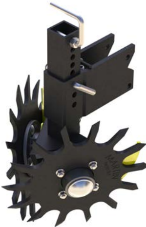
Shown with MT982

WA1332 Row Cleaner comes complete with 1 1/2" stem wheel assembly. (For use with all pin adjust brackets which accept 1 1/2" stems.)