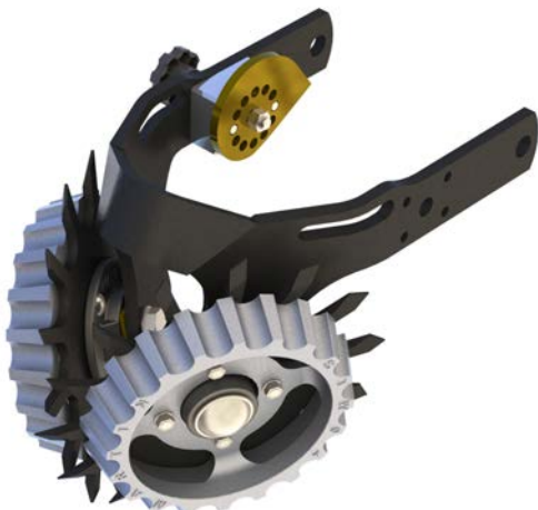
Shown with optional side treader wheels (STW-04) and Cam Adjustment (CA-03)