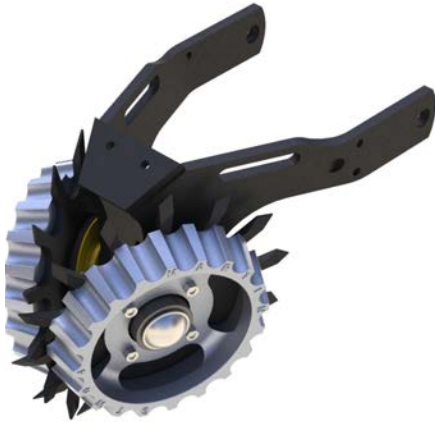
Shown with optional side treader wheels (STW-04)