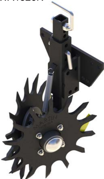
Shown with MT772