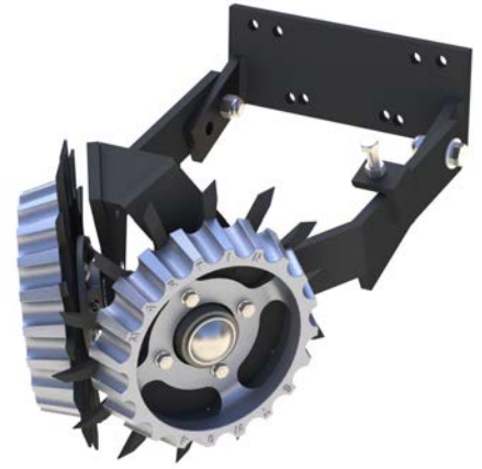
Shown with optional side treader wheels (STW-04)

C-125 was superseded by the WA1360; however, it is available for certain planter configurations with after market coulters. If in doubt, please call for assistance.