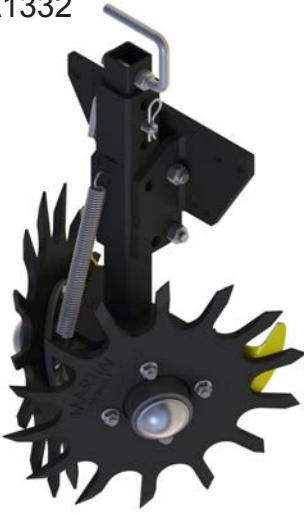
Shown with MT772