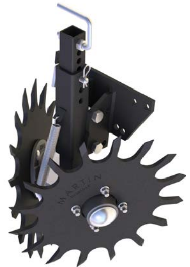
Shown with MT772