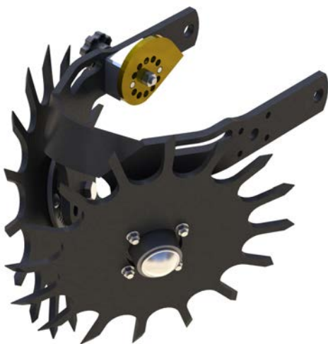
Shown with optional Cam Adjustment (CA-03)